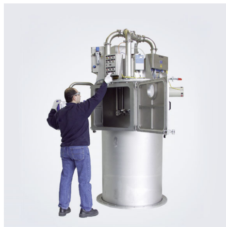
Gastight version of the DROPPO® 300 system, with view into the process chamber