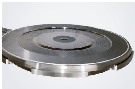
Die plate on lifting device