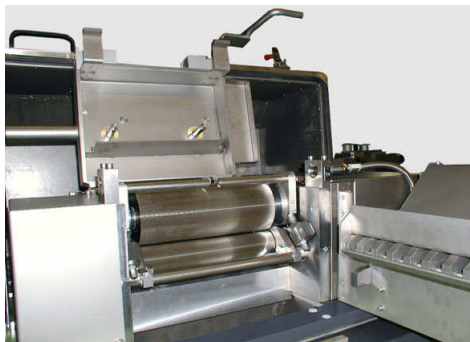
View into PRIMO Plus cutting head

* Further range of strap width and strap thickness on request.