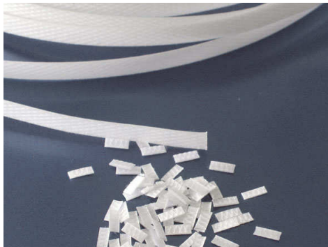
PET strap, pelletized

Due to very flexible installation concepts, the pelletizer can be used for multiple extrusion lines. The control unit of the PRIMO Plus can be integrated into the production line master control.